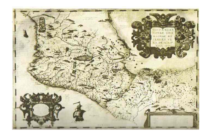
Figure 3 Plan of the Viceroyalty of New Spain 1579.

Here takes the Camino Real relevance that served to mobilize all that amount of merchandise that was traded by the booming Port of San Blas, since it left San Blas, passed through Tepic, Ahucatlán, Tequila until arriving at the city of Guadalajara; and, to the latter, goods arrived from all over the colony, and later Mexico, to export / import.