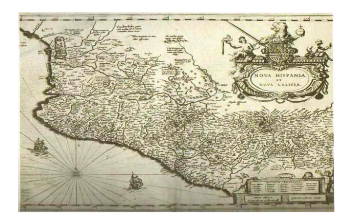
Figure 4 Map of the western zone of the Viceroyalty, coming from the atlases of Janssonio and Blaew (XVI Century).

CAMELO-AVEDOY, José Octavio & RODRÍGUEZ-BAUTISTA, Juan Jorge. ¿Why tequila is named tequila? An approach from the regional economic history. ECORFAN Journal-Mexico 2017